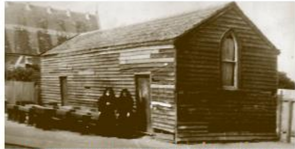
Original School for First Victorian Foundation established in Numurkah by Mary MacKillop herself in 1890.