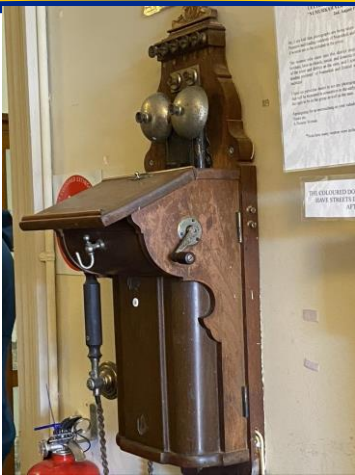
An old non mobile