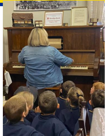
A talented piano player -no hands!