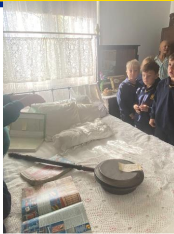
An old electric blanket