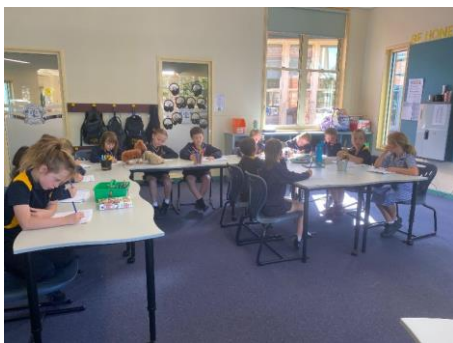
Students planning their letters

In Literacy we have been busy working through the sounds in our 'Sounds Write' groups. The children will continue to bring home decodable readers that support the sounds they are learning in class. These books may be easy for the children and that is ok. Books that are easy provide confidence and allow children to