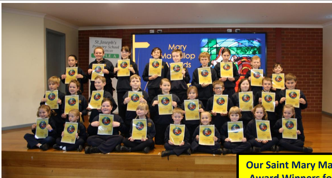
Our Saint Mary MacKillop Award Winners for 2022

I can hardly think of a more meaningful and powerful day of activities for our children !