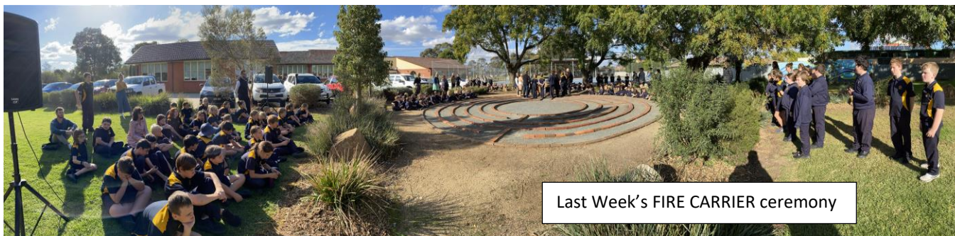
Last Week's FIRE CARRIER ceremony

Saint Mary MacKillop said, "Never See a Need Without Doing Something About It!" At St Joseph's We: Need to have a Positive Attitude Need to be Aware and Need to Take Action . Our next fortnight's Triple A Social Skill is Forgiveness Our focus within the three areas are as follows Attitude : Being Open To Forgiveness Awareness : That Relationships Need To Be Rebuilt Action : The 4 Steps Of Reconciliation