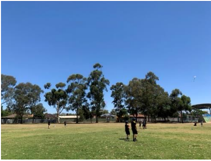
Flying kites with our buddies in "Kite" week.

We are so thankful for the kindness and friendliness shown to our Prep children by their Year 6 Buddies. The relationships formed will stay in the memories of our children for a life time. We also thank the Grade 6 teachers for their enthusiasm to continue the Buddy Program throughout the year.