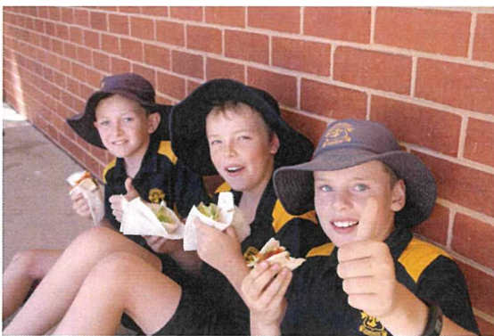
Some of the Seniors enjoying Taco Tuesday last Term.