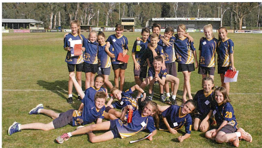
Above Some of the Cross Country Participants