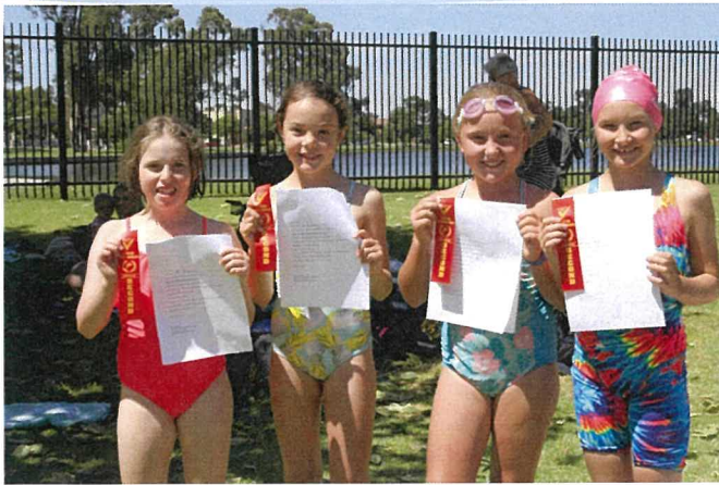
9/10 Girls relay team