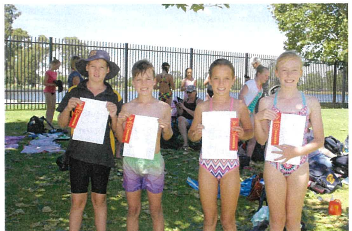
11 years mixed relay team

We wish them all the best for their events.